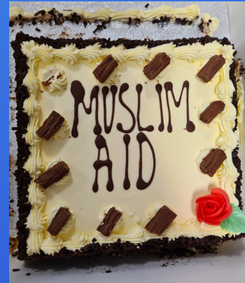
A beautiful cake made and donated by a parent