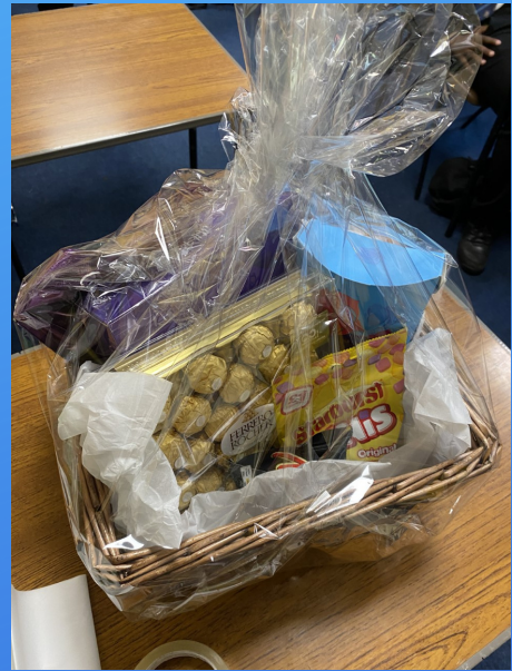
9DAD/DMD hamper which was raffled to raise money

Students selected two charities, Muslim Aid and Save the Children and planned a range of charity events. Each year group worked to raise funds, selling food and crafts and holding raffles. A non uniform day was also held in order to raise money. Families were also very supportive and provided baked goods, which were raffled and many made generous donations. The students raised £2070 and should be incredibly proud of their efforts.