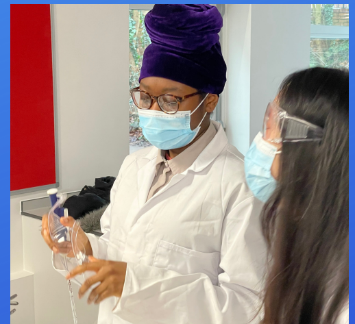
Sixth Form students back to experimenting